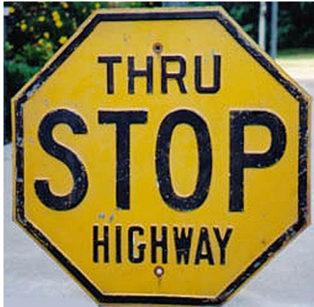
Early stop sign.

match given the brothers' focus on electricity, but from what I've been able to determine, the type of wiring that was common in America until the 1930s, called knob and tube, didn't use junction boxes as we know them today.