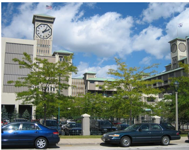
Both Towers Current clock and original clock tower converted to temperature gauge.