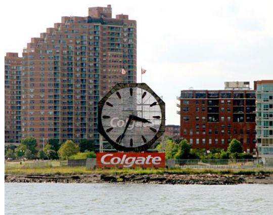
Colgate clock, New Jersey.

Instead, they say its origin is probably fairly mundane, strictly a matter of style, manufacturability, and marketing. The octagonal shape is simply more exotic and perhaps more appealing than a plain square or rectangle and, in the years before modern manufacturing, far easier to cut from wood stock—even with all the mitered corners—than a perfect circle.