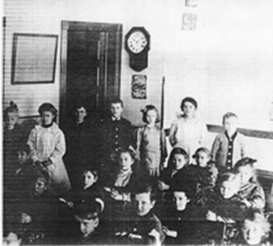
Schoolhouse clock in early 1900s West Allis classroom.