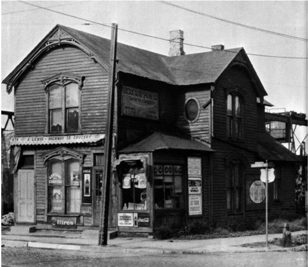
Allen-Bradley's first location was in this building above Gordon's Codfish.

It is interesting to note that the first tower—like the one that held the black-faced clocks and now holds a four-sided temperature gauge and the one that holds the current clocks—was primarily intended to hide the building's water tower. It wasn't purely decorative.