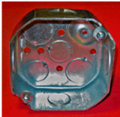
Modern octagonal junction box. Photo by author.

Photo by John Rietveld, signalfan.com. Used with permission.