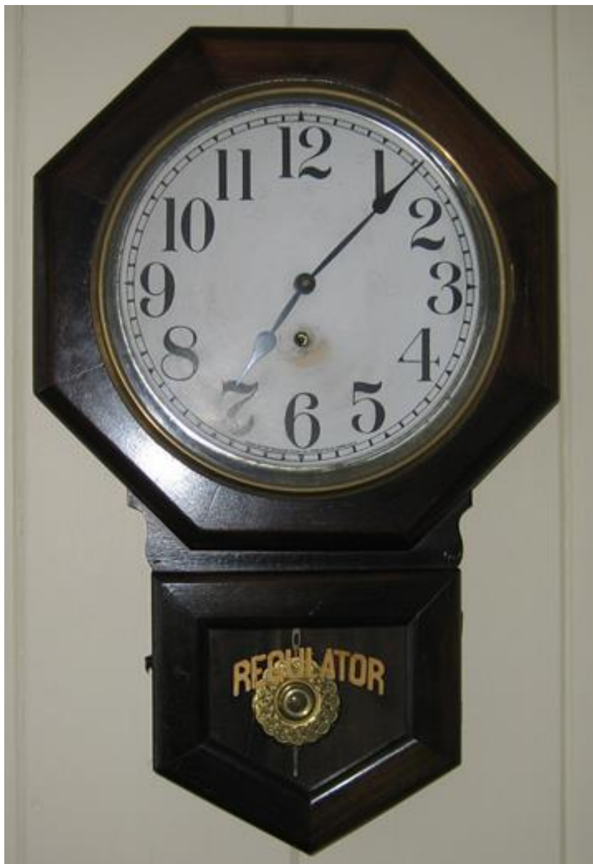
Sessions Clock Company schoolhouse clock.

The word was appropriated by enterprising clock makers, he explained, to inflate the precision of cheaper devices. "It was a marketing ploy," Bailey continued. "In the second half of the 19th century, true regulators cost $1,000 or more whereas a schoolhouse clock could be purchased for just $5.00."