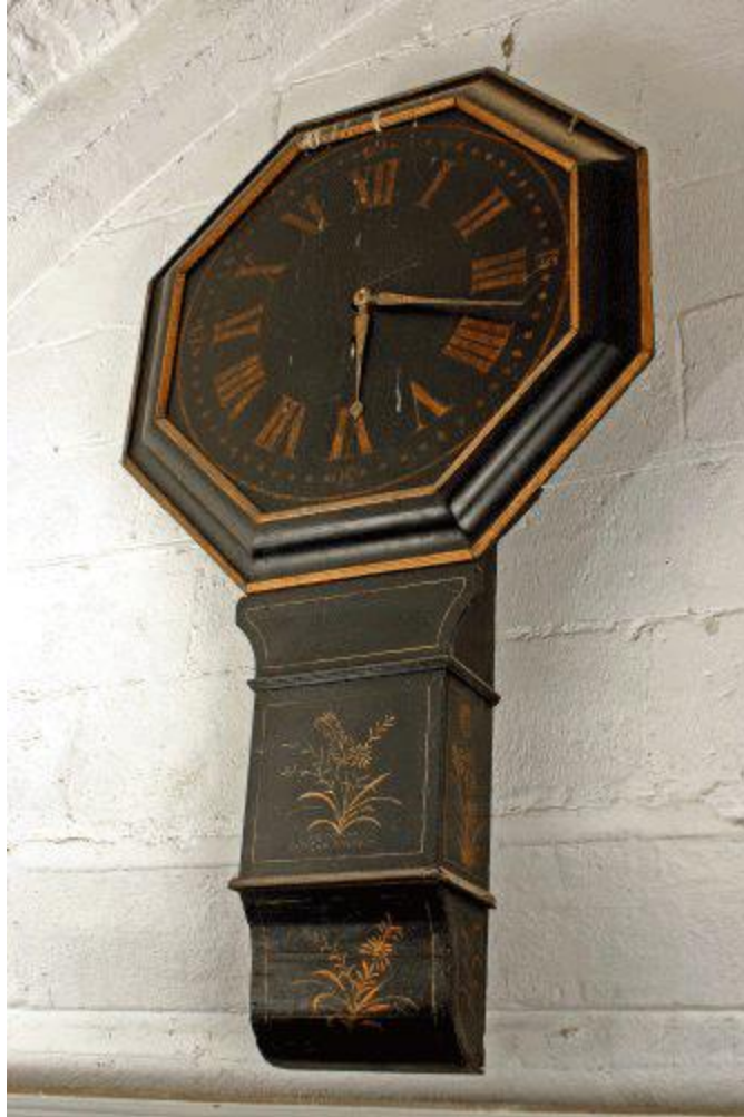
Act of Parliament Clock, 1797.