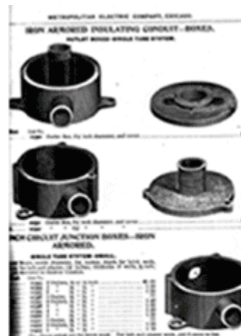
Junction boxes shown in 1912 catalog. octagonal junction box.