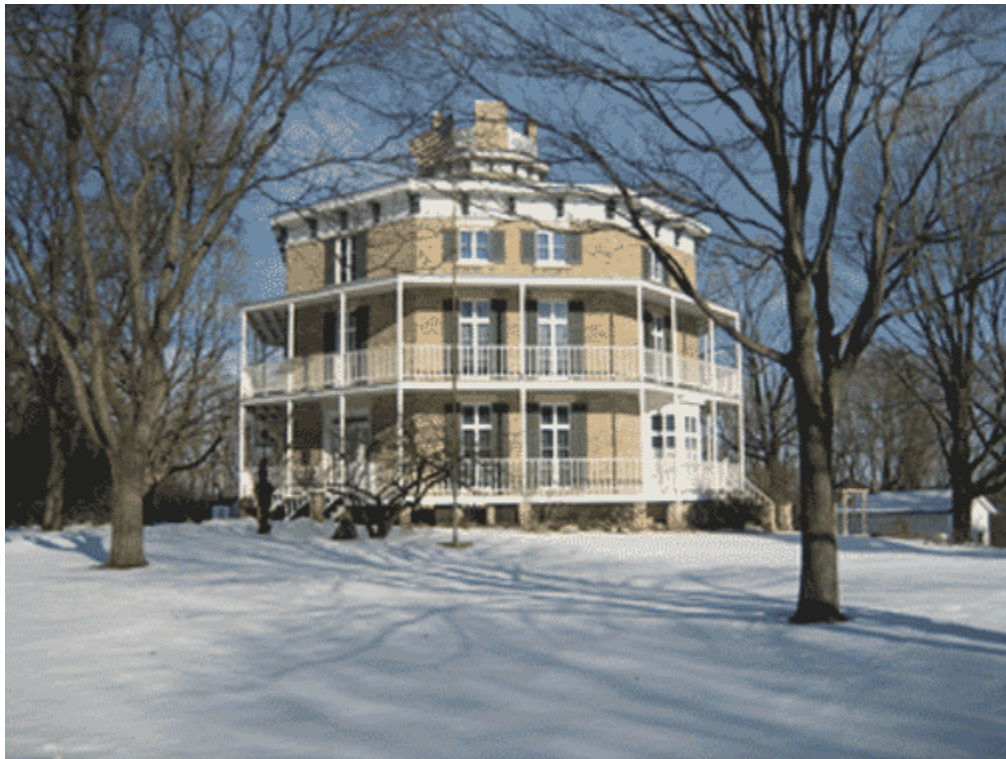
Richards octagon house, Watertown, Wisconsin, completed in 1854.

One more potential influence influence came to my attention while researching the history of tower clocks. Underscoring the marvel that is the Internet, I came across a site that presented information on the largest clocks in the world, Allen-Bradley's four-sided tower clock among them.